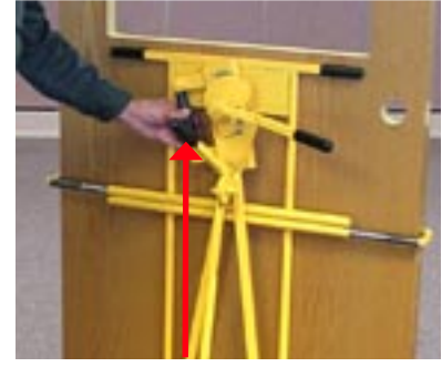
The Side Tilt Adjustment Wheel adjusts the door from Right (2°) to left (2°) on either side of plumb.