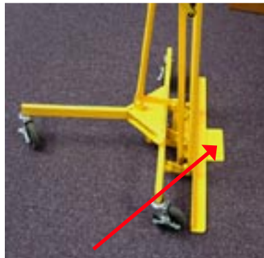
The Floor Plate moves out to support the door when in plumb or past plumb position.