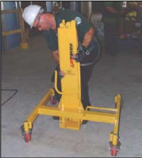
Simple one person assembly in just a few minutes, no tools required.