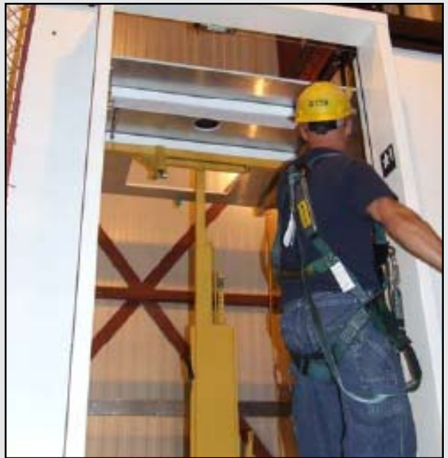
Long cord on the remote pendant station allows the installer to stand outside the hoistway as the canopy is being lifted into position.